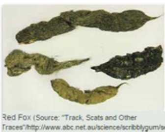
Red Fox