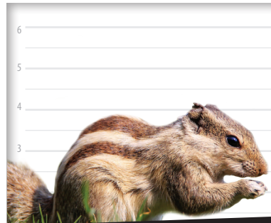
INDIAN PALM SQUIRREL