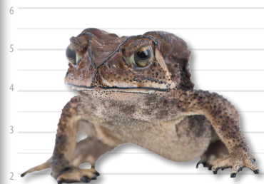
ASIAN BLACK-SPINED TOAD