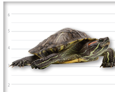
RED-EARED SLIDER TURTLE